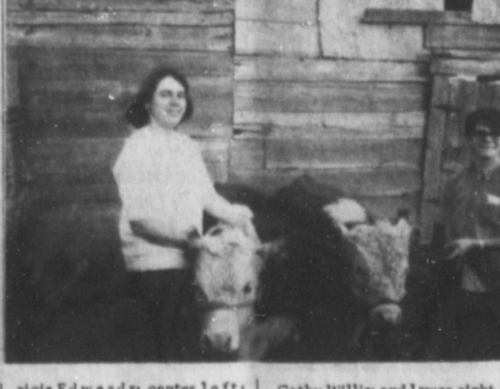
Shown here are some more of the 4-H club youth, and the animals they are fitting for the Stock Show which will be in