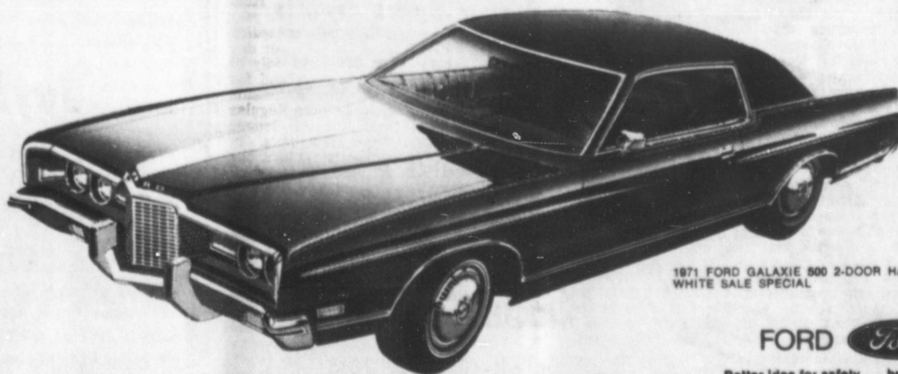
1971 FORD GALAXIE 500 2-DOOR HARDTOP WHITE SALE SPECIAL

Torino. Right in the middle on size and price.