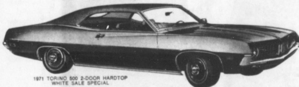
1971 TORINO 500 2-DOOR HARDTOP WHITE SALE SPECIAL

Maverick. Right price for a simple compact car.