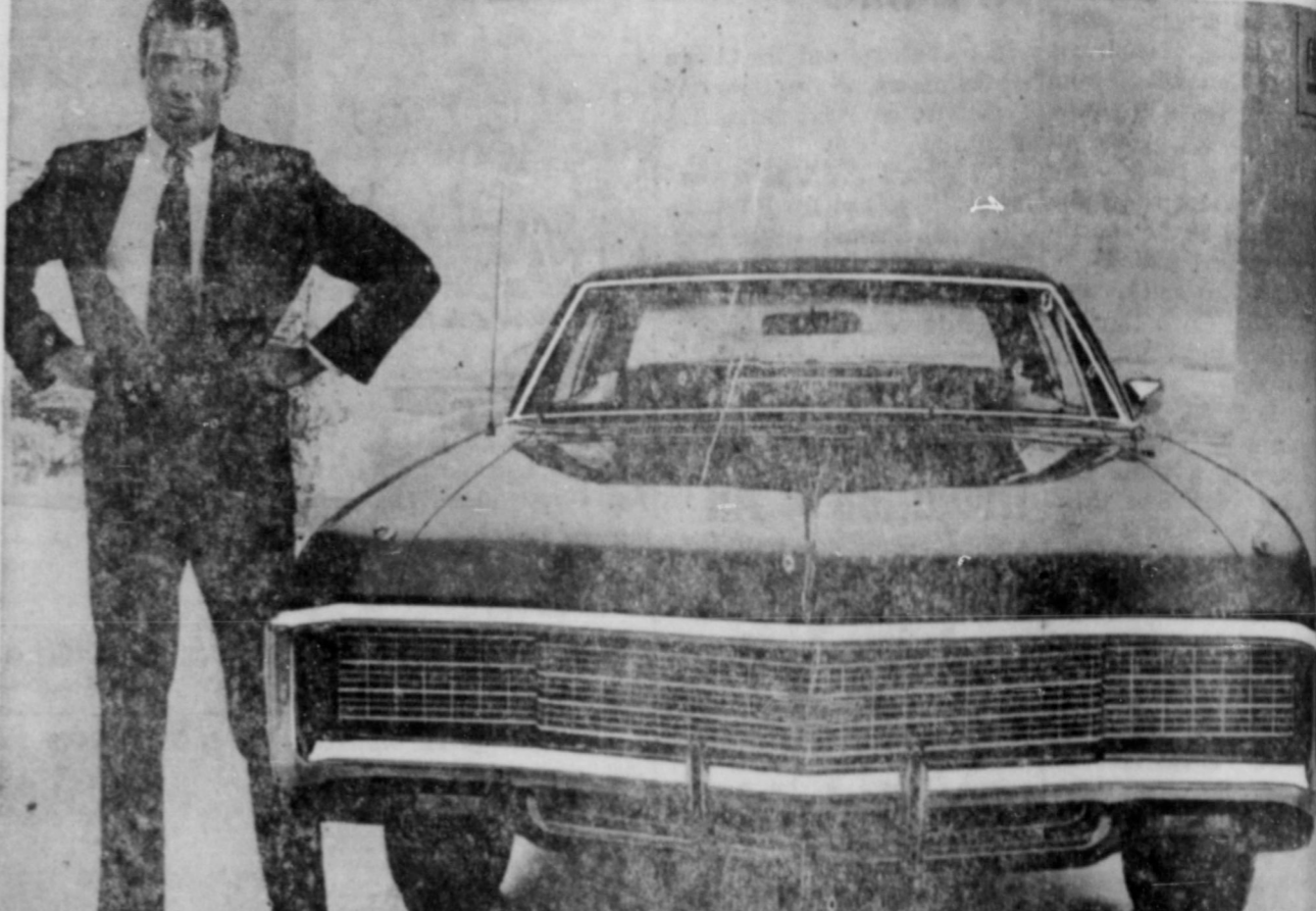
1969 Caprice Coupe

No clowns. No hoopla. No funny hats. This is an event for the serious car buyer. The man who has X number of dollars to spend and is determined to get his money's worth and maybe more. Come to a Chevrolet Showroom during our Value Showdown. Ask the man to show you, on paper, how you can order most any 1969 Chevrolet with a big V8 and automatic transmission for less than you could last year. Then go down the street or across town and see how we stack up against Those Other Cars. We think you'll wind up with Chevy. More people do, you know. Putting you first, keeps us first.