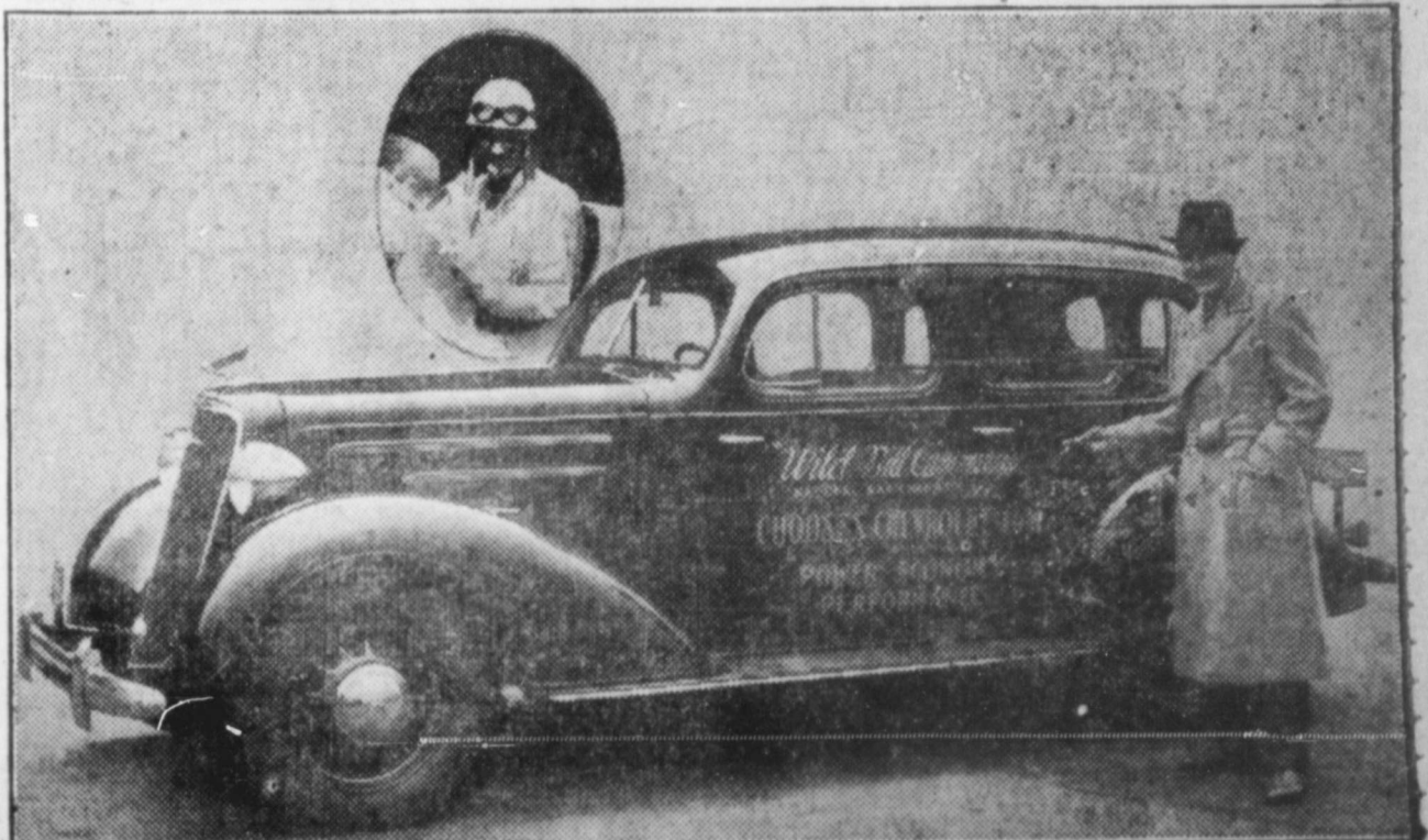
"Wild Bill" Cummings, national A. A. A. racing champion, recently took delivery of his second Chevrolet—a new 1935 Master De Luxe sedan with which he is pictured above. Cummings became a Chevrolet owner following his victory at Indianapolis last Decoration Day. In the oval he is shown as he finished the Indianapolis classic, wearing the new type crash helmet that was recently adopted by the A. A. A. Contest Board for all racing drivers in 1935.