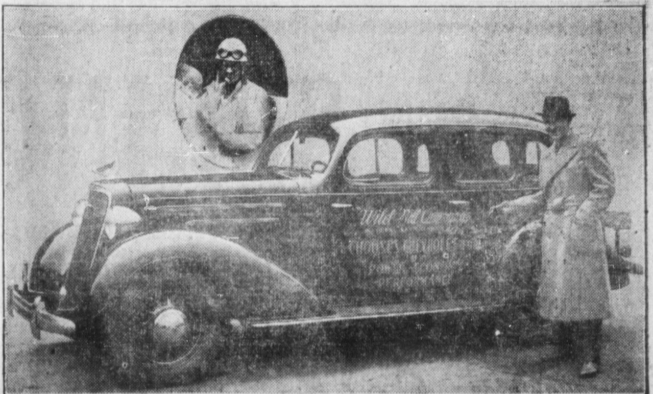
Wild Bill Cummings, national A. A. A. racing champion, recently took delivery of his second Chevrolet—a new 1935 De Luxe sedan with which he is pictured above. Cummings became a Chevrolet owner following his victory at the Indianapolis classic, wearing the new type helmet that was recently adopted by the A. A. A. Contest Board for all racing drivers in 1935.

limited amount of household for families without these needs also will be furnished, rural said.