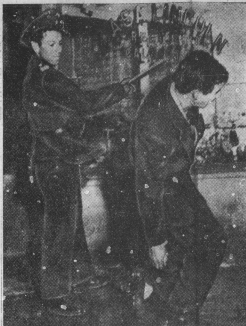
THE FORM'S THE THING —If you wish to know the correct way to club a man, study this picture. Note the policeman's excellent form as his subject sags in Bogota, Columbia. Occasion for the demonstration of skill was a riot started when supporters of one presidential candidate started slugging it out with an opposition group.