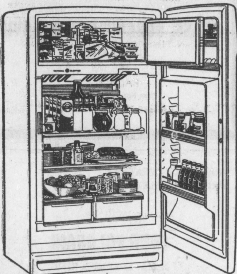
Model LJ 12S