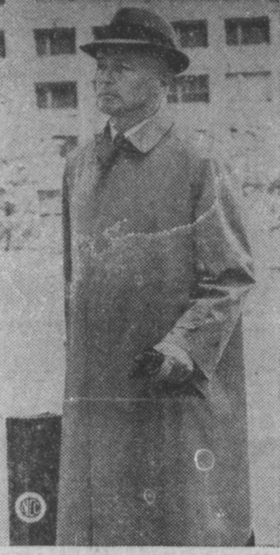
Prominent on the men's fashion scene this fall will be this all-purpose cotton coat by Rain-fair. The coat, treated with Zelani for rain protection, has a plaid cotton lining and continental stand-up collar. It is washable and Sanforized.