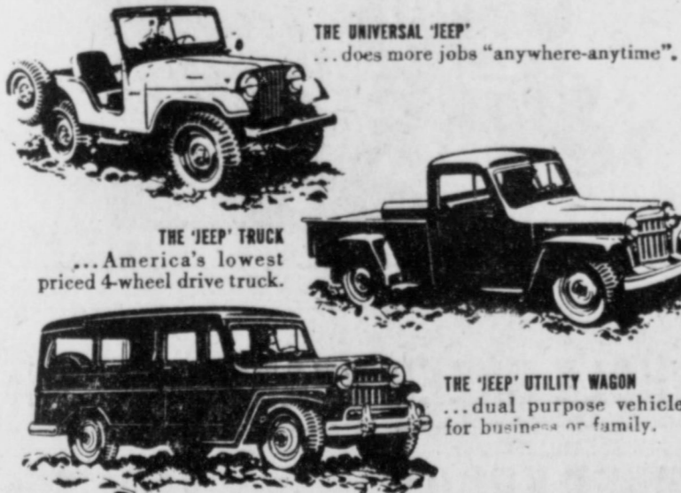
THE UNIVERSAL 'JEEP' ... does more jobs "anywhere-anytime".