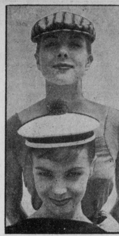
CAPS ARE SET—Fashion sets her cap for summer with an "Ivy League" sports model in striped madras, top, and a French-inspired sailor beret, bottom, of white pique set off with a red pompom.

TAKE PICTURES NOW, pay later. Small down payment on still cameras, slide projectors, Bell and Howell movie cameras and projectors. Polaroid "picture in a minute" camera, too. See us today for easy terms. Roaten Welgreen Drug Store, phone 3331. ctf