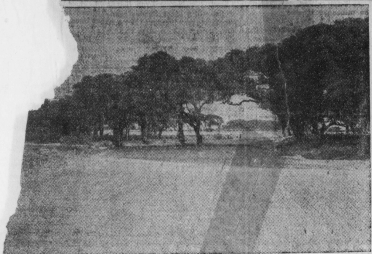
ROCKPORT STREETS—Shaded by wind-whipped live oaks, a $128,000 network of streets the Little Bay Shores area along one of the most beautiful strips of the Texas coast between Rockport and Fulton Beach. The streets were built by Heldenfels Brothers, Corpus Christi general contracting firm.