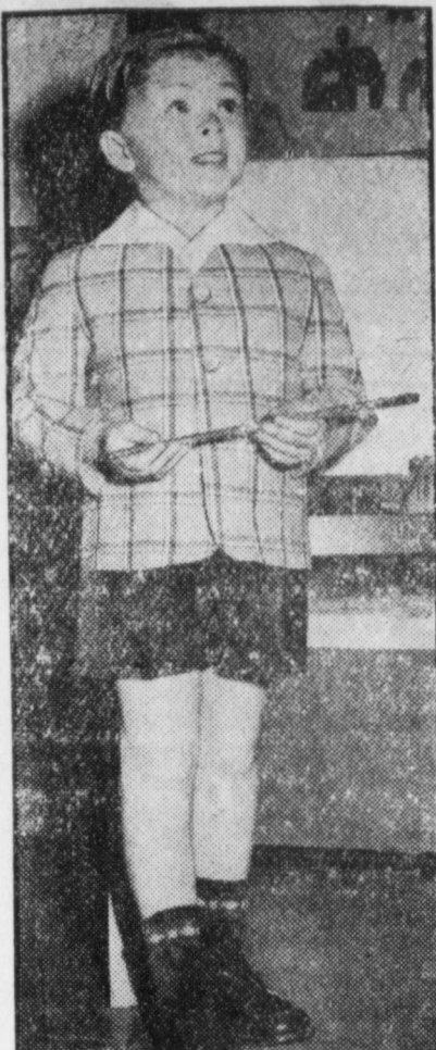
SCHOOLTIME TOGS — A fashionable back-to-schooler is this youthful artist wearing a smart checked Eton jacket by Chips and Twigs. Made of wool and orlon, the jacket is washable and comes with contrasting trousers.