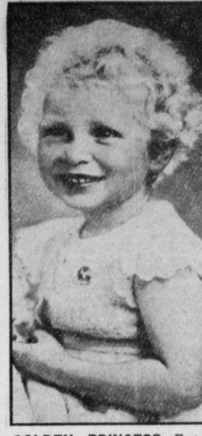
GOLDEN PRINCESS —England's Princess Anne, daughter of Queen Elizabeth II, smiles happily as she celebrates her third birthday. The tiny, golden-haired tot is wearing the dress she wore at her mother's coronation.