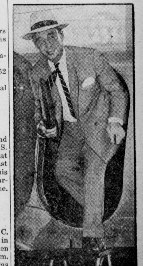
FLYING START —The Democratic presidential candidate is on the move as campaign days begin. Seen here leaving a plane at Chicago airport, Illinois Gov. Adlai Stevenson carries a briefcase full of notes and the look of a man in a hurry.