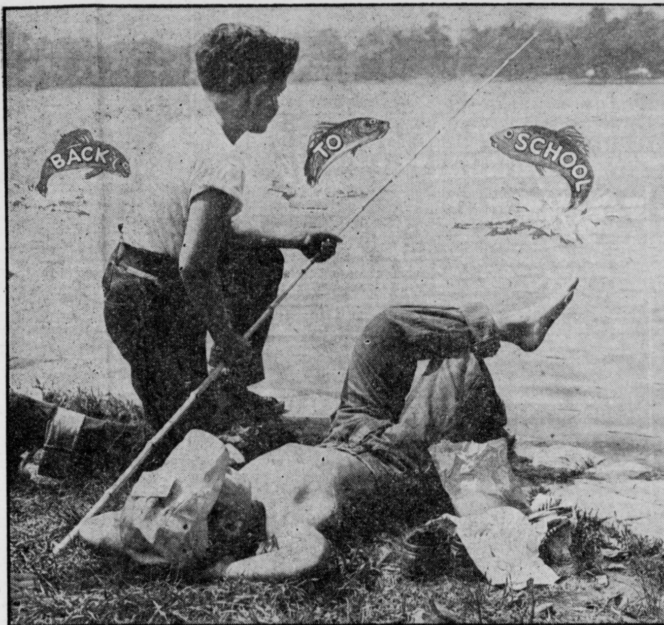
FISHERMAN'S NIGHTMARE —Never have the fish seemed so taunting as they do this time of year when carefree young anglers must hang up their poles and bobbers, and resume the roles of "careworn" scholars. On the last day of vacation the blue gill and sun fish leap teasingly high, seeming to know that the young Izaak Waltons won't be around tomorrow.

It is rumored that cheerfulness is largely a matter of one's income being above one's outgo.