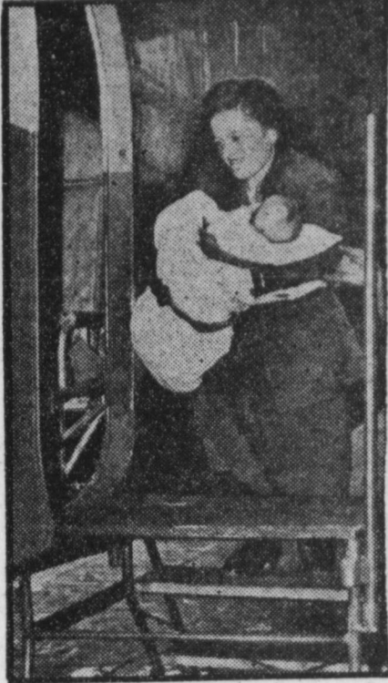
FLIGHT TO FREEDOM— Fleeing a Communist East German regime, this young German mother climbs aboard the "Refugee Air-Lift" in Berlin's western zone, with her baby in her arms. She will land in free West Germany. Thousands of former red-zone residents are crowding into West Berlin, creating a refugee problem which the West Berlin Senate hopes to lessen by chartering cargo planes, converting them to passenger-carrying units in the air-lift to freedom.