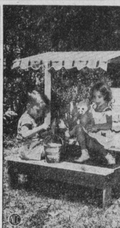
Too much summer sun won't spoil the fun of these small fry, for they can play happily in the shade in their water or sand-filled yard box when Old Sol gets too hot. The cotton canvas awning top can be replaced in bright new colors from year to year, the National Cotton Council reports.

We've never been able to figure out—"When a doctor gets sick and another doctor doctors him, does the doctor doing the doctoring have to doctor the doctor the way the doctor being doctored wants to be doctor, or does the doctor doing the doctoring of the doctor doctor in his own way?"