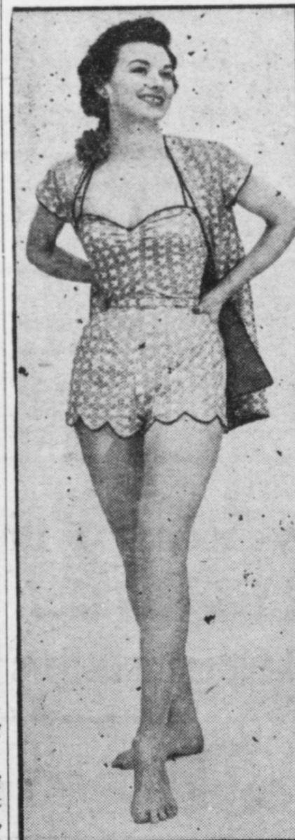
TWO FOR THE SHORE—Complete with a waterproof carnation on the shoulder strap, this beach ensemble is ready for either beach or surf wear. The suit and jacket, shown in New York, are done in an attractive print. The jacket is lined in red.