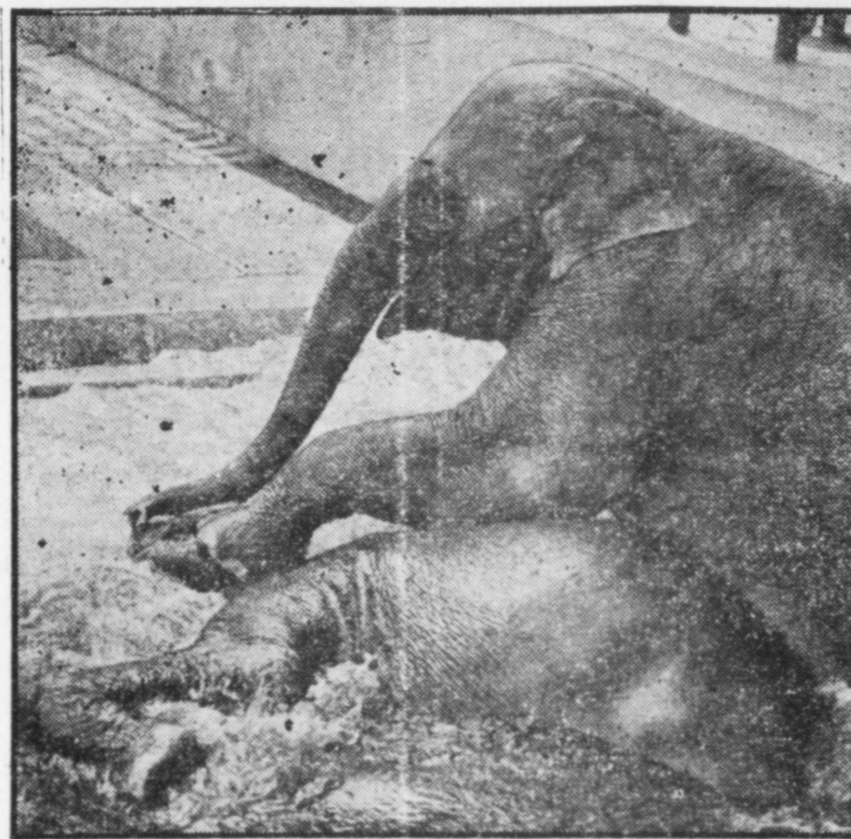
GO SOAK YOUR HEAD—With a helpful push in the face, Judy helps her slightly smaller companion, Lucy, in getting under some cool water at Central Park zoo in New York. Lucy didn't seem to mind the heavy assistance as the two elephants frolicked like children in their pool.