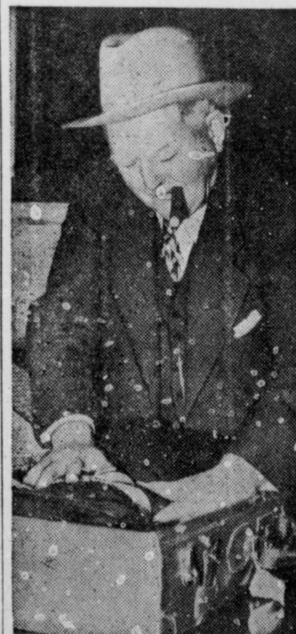
Former Vice President John Nance Garner packs his bags and leaves Washington for his home in Uvalde, Texas, a few hours after the inauguration of President Roosevelt and Vice President Wallace, winding up a 36-year political career in the nation's capital.