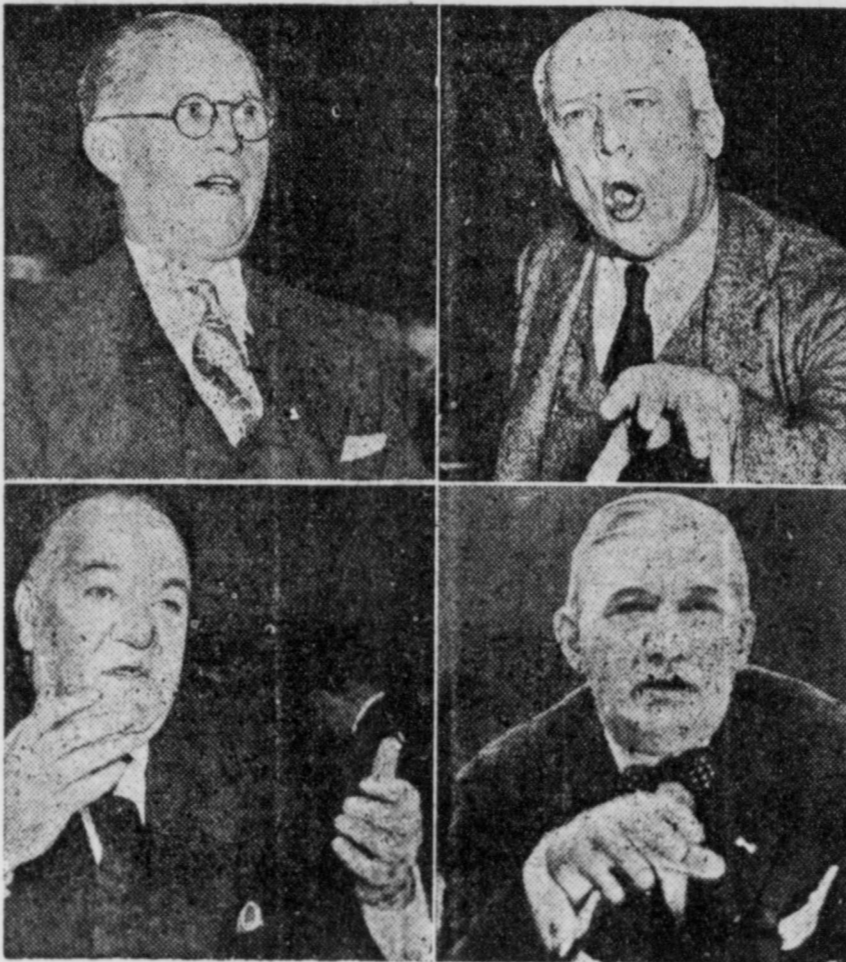
Earnestness, sincerity and patriotism are revealed in these candid camera "shots" of four national figures as they testified on the "Lend-Lease" bill. They are: upper left, J. P. Kennedy, retiring ambassador to Britain. Lower left: Hugh Johnson, columnist. Upper right, Norman Thomas, socialist leader, and William Knudsen, defense production chief.