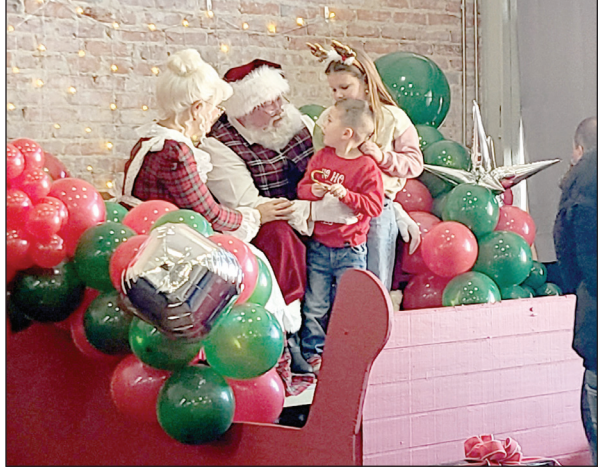
United Way board members and agency representatives hosted Breakfast with Santa at the Courtyard on Saturday.