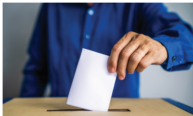
2. COAHOMA VS ROOSEVELT