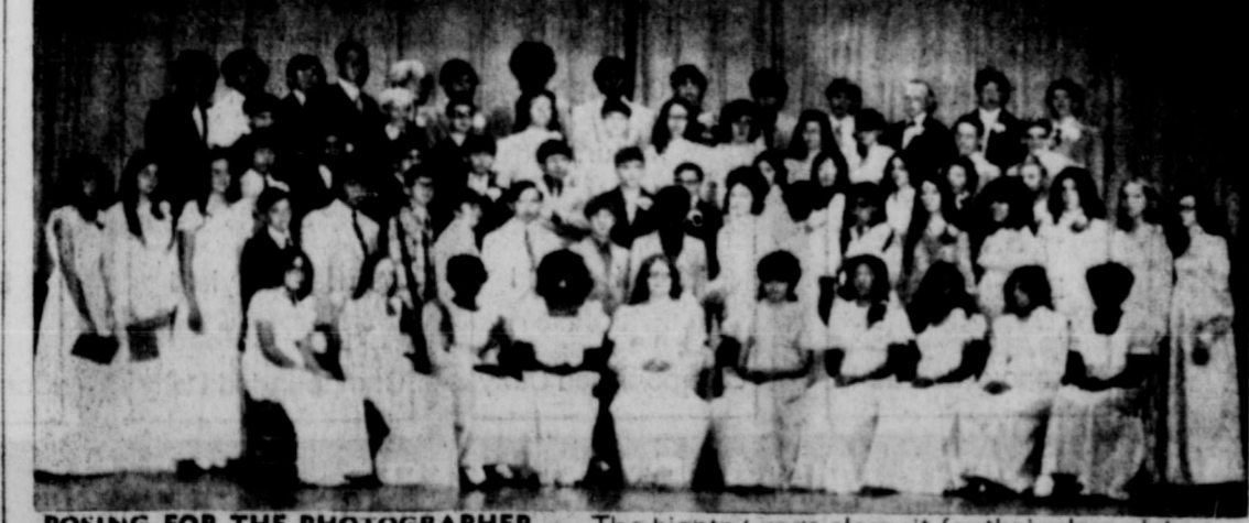
POSING FOR THE PHOTOGRAPHER — The Eighth Grade class sit for their class picture following ceremonies.