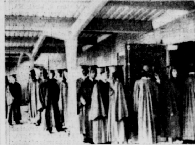
PREPARING TO MARCH — The Graduates of the class of 1973 are preparing to take that last trip down to the front of the auditorium of Stanton High School.