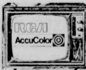
RCA AccuColor solid state table-top TV

To obtain repairs under this warranty, contact your RCA dealer or your service agency. Should additional information be desired, contact RCA at the address listed below. GIVE YOUR WARRANTY REGISTRATION CARD. It is to be presented at the time service is performed in order to obtain the benefits of this warranty.