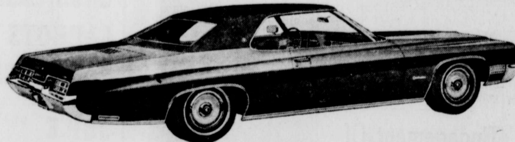
1971 Buick Centurion. This is our newest Buick, a city car with sleekness and grace as well as muscle. It features more nimble variable-ratio power steering, power front disc brakes, Full-Flo ventilation, and a vinyl roof on the Centurion Formal Coupe as standard equipment.