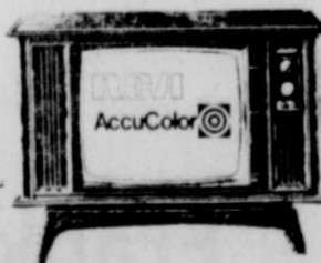
From RCA comes all-solid-state AccuColor