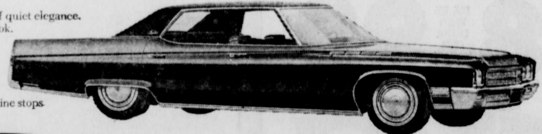
1971 Buick Electra 225. A new interpretation of quiet elegance. We've improved our Electra everywhere you look. There's more room in every direction, interiors that can be appreciated as much for their durability as for their beauty and comfort, even a new balanced braking system. A unique valve proportions braking force front to rear to help give you quick, smooth straight-line stops.