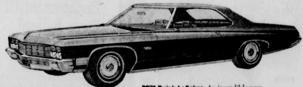
1971 Buick LeSabre. An incredible new offering of Buick value. The LeSabre, like the Riviera, Electra and Centurion, features AccuDrive, a new version of the directional stability system we pioneered. It will help give you smooth handling.