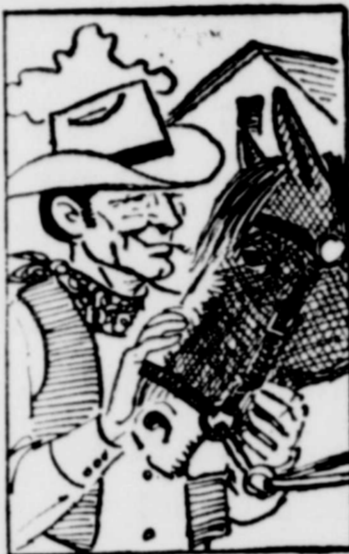
WORKIN' IS WHAT BUYS THE GROCERIES BUT PLAYIN' IS WHAT PROVIDES THE SPICE.