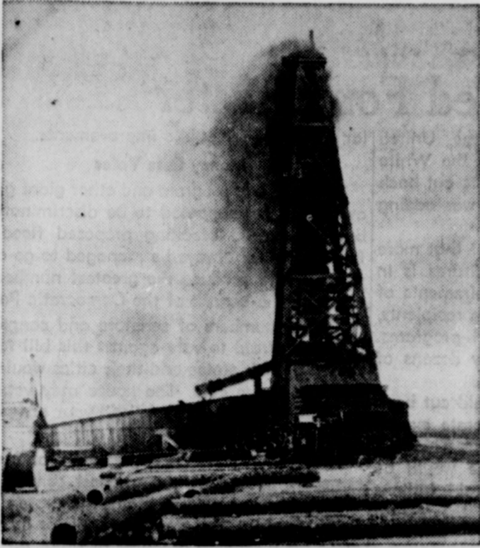
SANTA RITA, 1923 — This well drilled on University of Texas land in West Texas opened up the Big Lake field, May 28, 1923, from a depth of 3,028 feet, and drew attention to the now famous Permian Basin oil province and put the first "oil money" in the University Permanent Fund, which now holds more than $447 million from royalties, rentals and bonuses.

The first shot in the Civil War was fired on Jan. 9, 1861.