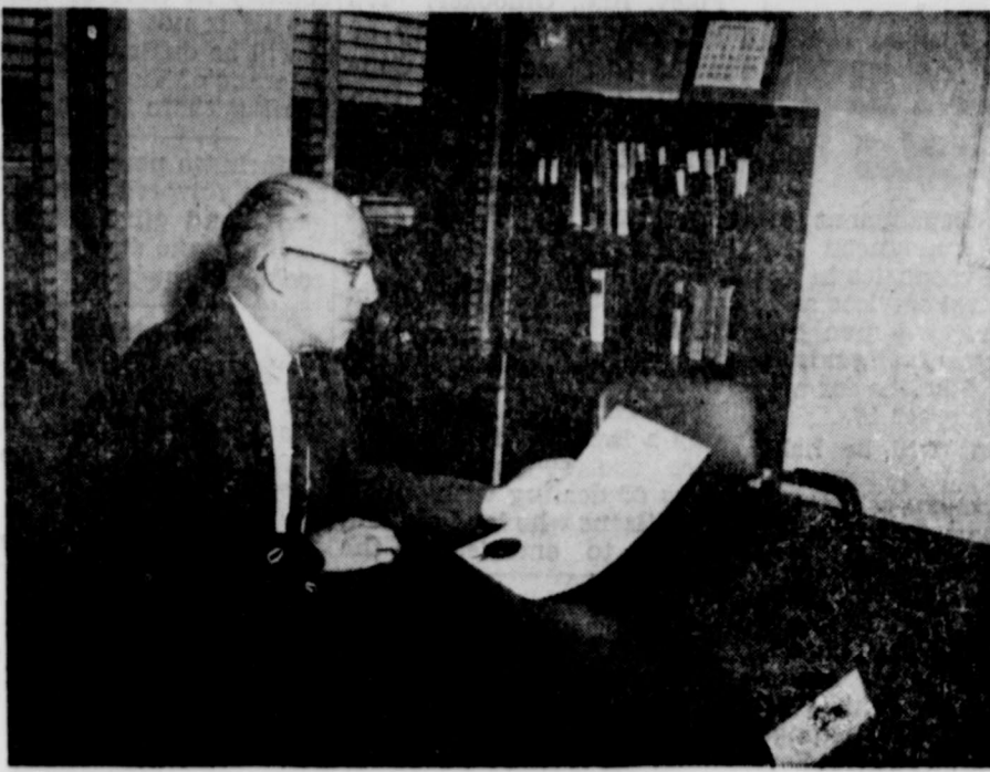
CROP AND LIVESTOCK REPORTING SERVICE CELEBRATES 100 YEARS OF CONTINUOUS REPORTS