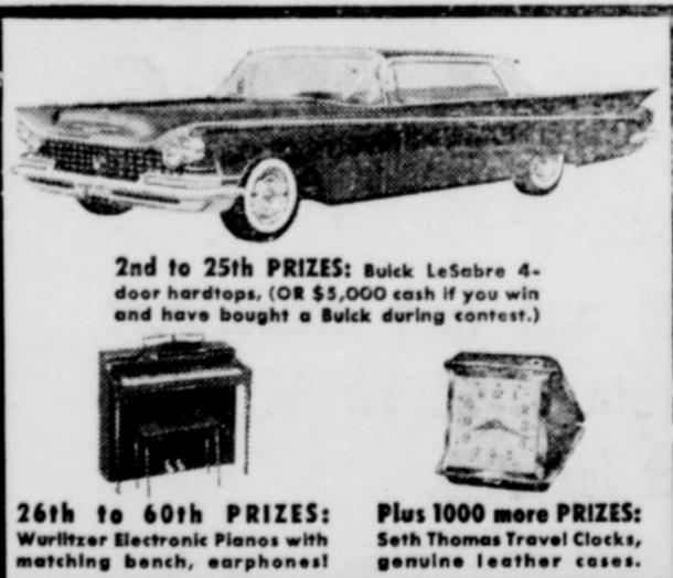
2nd to 25th PRIZES: Buick LeSabre 4-door hardtops. (OR $5,000 cash if you win and have bought a Buick during contest.)