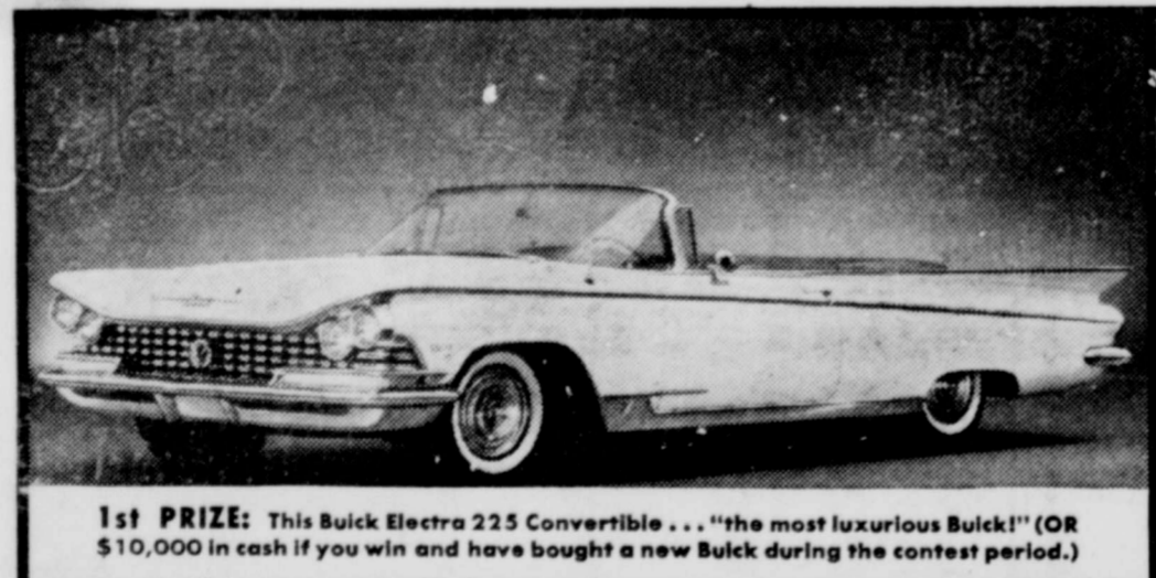
1st PRIZE: This Buick Electra 225 Convertible... "the most luxurious Buick!" (OR $10,000 in cash if you win and have bought a new Buick during the contest period.)