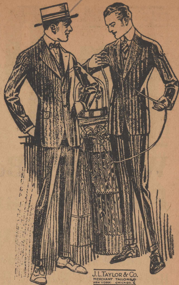
J. L. TAYLOR & CO. MERCHANT TAILORS NEW YORK CHICAGO

Can't do better for your looks and we can't do better for you or ourselves; than to get you into one of J. L. TAYLOR Made to Measure Suits.