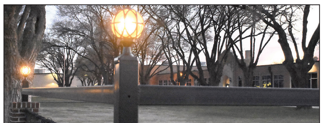
Decorative globe lights were recently installed along the fence on the north side of the Friona Junior High campus that faces Highway 60.