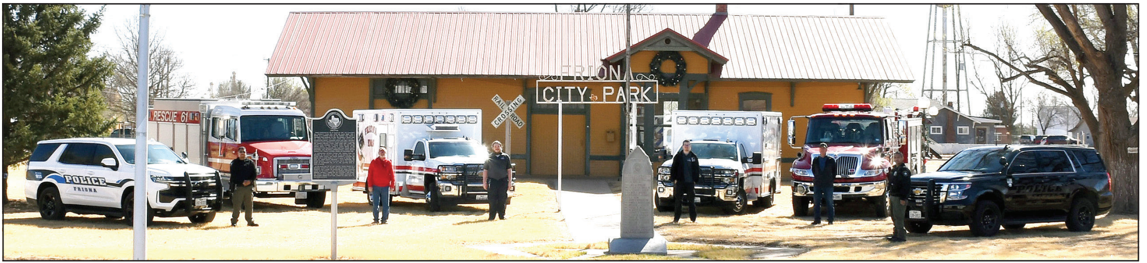
Noon - 2 pm @ K3 Towing and Friona Community Center • Helicopter • Ambulances • Fire & Police Vehicles