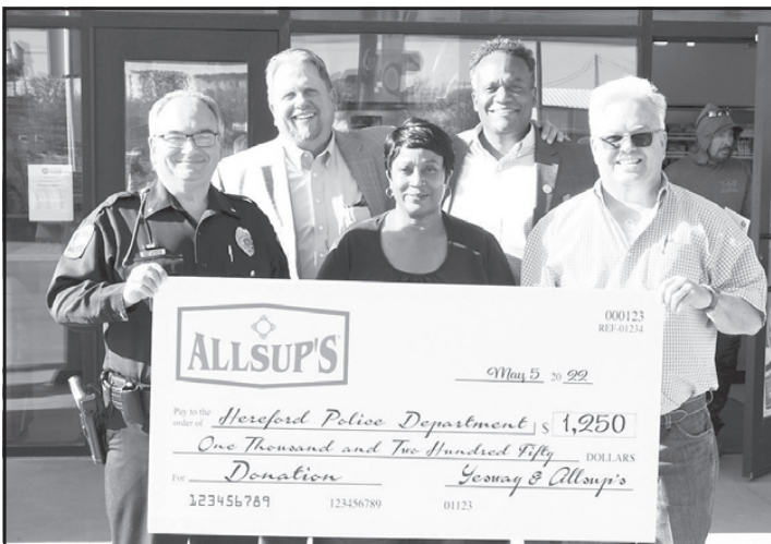
Hereford Police Department