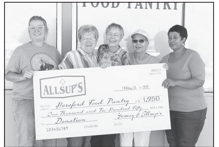
Hereford Food Pantry

Friona★Star is online at frionaonline.com