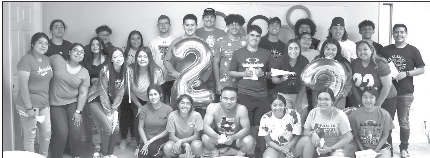
The last FHS Senior Banquet was held last Monday evening at Temple of Adoration - Templo de Adoracion. Again, thanks to all the churches who held banquets in honor of the Class of 2022.

Great for graduation parties and/or gifts!