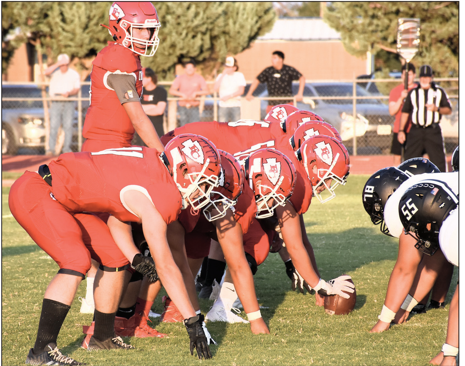
The Chieftain offensive line has been a driving force in the success of the team this year. Last week, Friona running backs rushed for 673 yards and 9 touchdowns in the 62-42 victory over the Tulia Hornets. On Friday, the "Pink Out" cancer awareness game this year will be a "Battle of the Unbeaten" as the Chiefs host the #3 ranked Childress Bobcats.