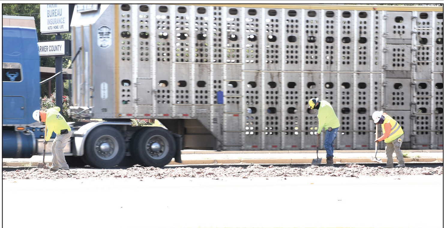
Dirty Jobs was a television series that ran from 2005 until 2012 in which host Mike Rowe was shown performing difficult, strange, disgusting, or messy occupational duties alongside the job's current employees. TW&M employees could have used Mike's help last Thursday afternoon with the clean-up on aisle Hwy 60. You don't want to know.