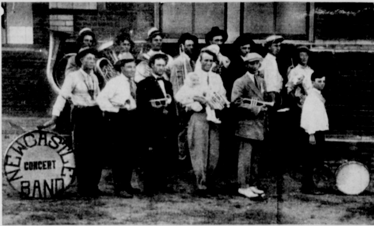
NEWCASTLE CONCERT BAND OF 1915

All members of Young County TSHSC are urged to be present.