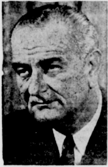
Lynden B. Johnson