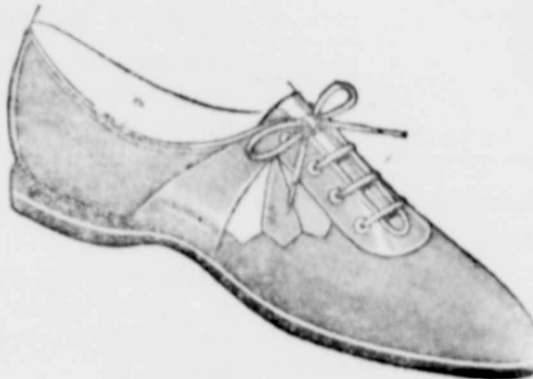
BUSTER BROWN A to D Black Washable Nylon Velvet Black Smooth Leather 6.50 6.99 and 7.99 4 1-2 to 6 6 1-2 to 8 8 1-2 to 4