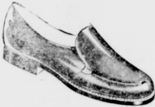
ROBIN HOOD Black—B C D 8 1-2 to 3 3.99