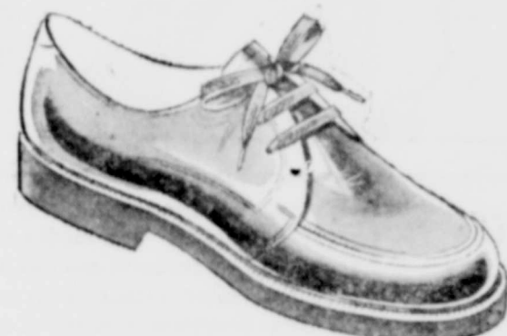
BUSTER BROWN 12 1-2 to 3—A to D This sole guaranteed to never wear out only 8.99