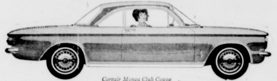
Corvair Monza Club Coupe

America's best sellers... Your best buys! Now at your Chevrolet Dealer's