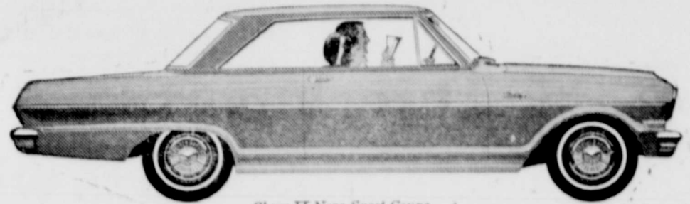
Chevy II Nova Sport Coupe