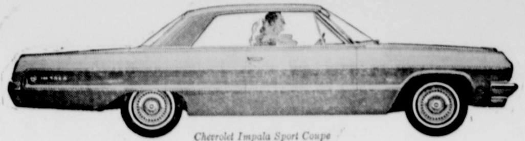
Chevrolet Impala Sport Coupe