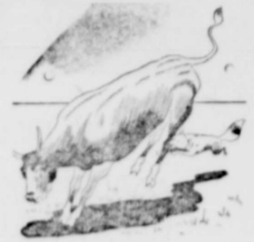
Rabies is spread to farm livestock by the bites of wild animals, or by other rabid livestock.

Prepared by American Foundation for Animal Health An alarming increase in rabies among farm animals has been reported by authorities. There has been a 400 per cent increase in swine, a 300 per cent increase in sheep, and a one-third increase among cattle. The disease has spread to wild animals, and that has made it more difficult to control. Rabid wild animals bite the livestock, spread the disease, and the cycle continues.