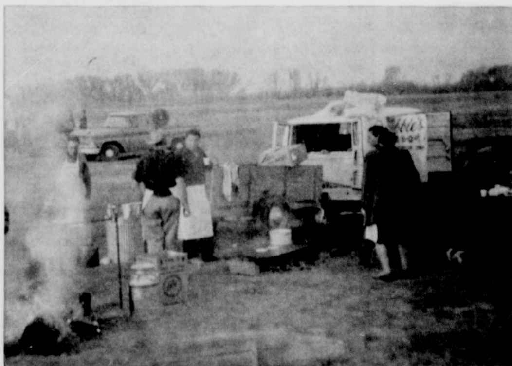
ROLLING PLAINS CHUCK-WAGON—Zebbies Bar-B-Que employees are shown above preparing breakfast for the Rolling Plains Wagon Train before leaving Spearman May 14 for Graham. They will also cater the Fort Belknap Civil War Centennial program on June 6.