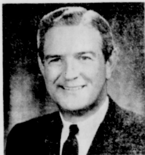
Governor John Connally

Everyone's invited! Bring the entire family. See our big, new plant... completely air conditioned... one of the finest in the men's apparel industry. Learn how Haggard Slacks are made... the best anyone can buy anywhere. More men wear Haggard Slacks than any other brand!