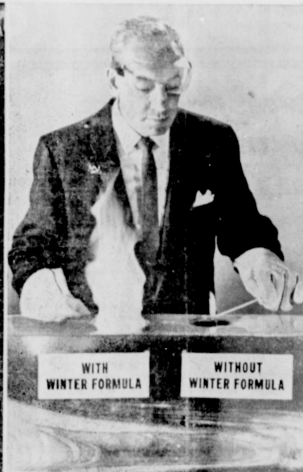
Winter-formula Enco Extra gasoline (left) fires instantly at -40° F. Gasoline not specially prepared for winter use (right) refuses to ignite. Winter Formula makes a big difference in your engine, too, at 40 below or 40 above.