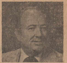
SUNDAY, AUGUST 29, 1976