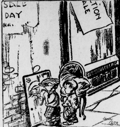
"Lookin' Glasses Is Only Fer Janes, Anyway"

received—and he has received the run-around. Certificates have been issued to veterans out of all proportion to the availability of surplus property. It has been impossible for a veteran or anyone else to get accurate and complete information, but there has been an abundance of misinformation that has caused many people to make long and expensive trips, only to be disappointed.