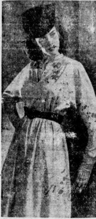
Beige wool jersey man's type dress is one of the more simplified sewing patterns to be found at local stores. Making your own clothes is the answer to a fat War Bond folder. U. S. Treasury Department