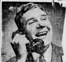
"Man, was that a relief! To know that you're getting the world's finest lubrication... and that your car's getting the best possible chance to last!"