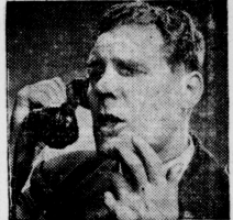
"It's had me worried. After all, I need my car and have to make it last! So here's what I did..."