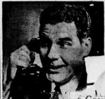
"I called my Gulf 'D' advised Gulfprid-Gulflex** treatment. lory. Said they'd get car a darn swell ch holding out!"