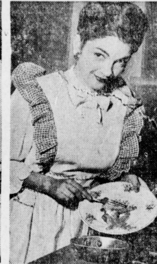
3. Raw and cooked meat left-overs are scraped into a pan and melted down over a slow flame on top of the stove or in the oven when it is being used for baking or roasting.