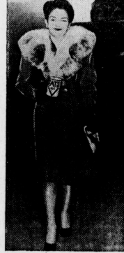
5. This careful housewife puts a paper cover on her can of fat (any tin can will do) and takes it to the butcher.

Get more red ration stamps, by following the simple, efficient steps worked out by home economics experts. The six news pictures on this page were taken by the New York World-Telegram to show its readers the most efficient way to save every drop of used cooking fat and how to turn it in for four cents and two red ration points a pound.