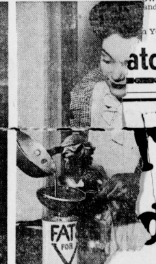
4. Accumulated fats are scraped into the container to move sediment. Usual fats are invaluable for thousands of military purposes. Scrap every drop.