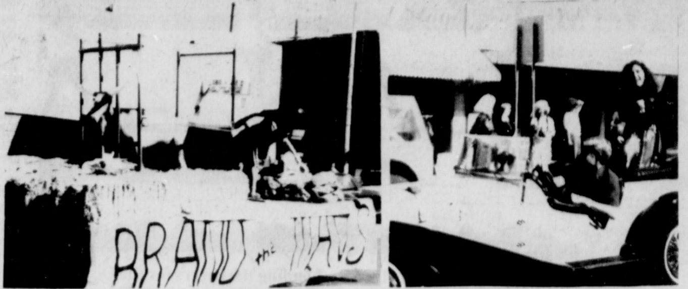
Junior Class float wins first place