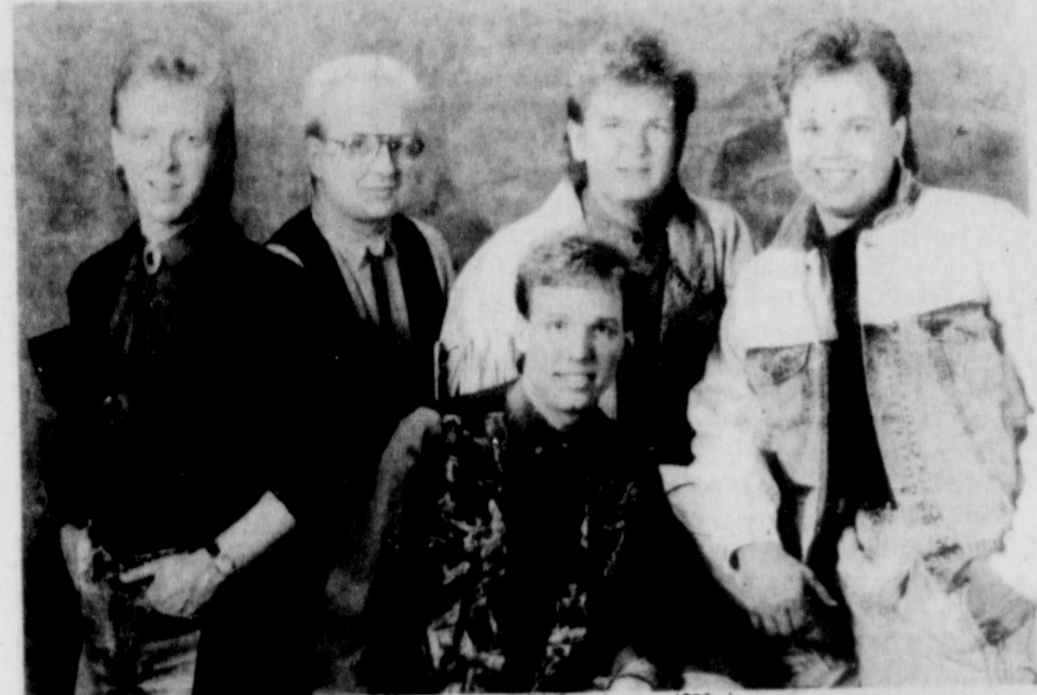
Mid-South Boys will present a concert Monday, September 10, at Breckenridge High School Auditorium, in Breckenridge. The concert will begin at 7:30 p.m. The concert will be sponsored by the Word of Life Ministries, Breckenridge.