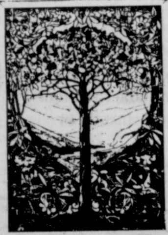
Tree of Life $55.

Only 3 Pieces Left At The Telegram!! Enamel on Glass for Your Windows or Gifts