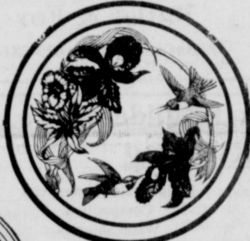
Hummingbird in Orchard $42.

See Them At The Telegram 215 S. Seaman Eastland, Tx 76448 629-1707