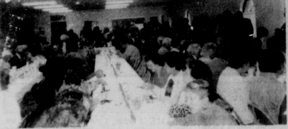
The Family Enrichment and Aging Conference was a tremendous success with over 170 persons attending the all-day conference on March 27th, in Eastland. Eastland County citizens as well as surrounding counties were present to hear outstanding speakers address the issues concerning caregiving and concerns for the mature person. Shown are the conference participants, who enjoyed a noon luncheon. The conference was sponsored by the Texas Agricultural Extension Service, Department of Human Services, Adult Protective Services, A.A.R.P. Cisco Junior College and Daugherty Street Church of Christ.

Eastland Telegram - Ranger Times - Cisco Press And Rising Star Thursday, April 5, 1990