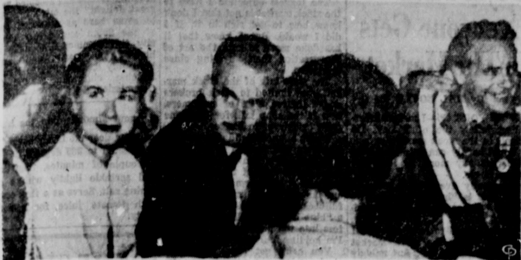
VISITING IN MAJORCA, Prince and Princess Rainier are entertained in Palma's government palace by Capitaine General Castejon (right).