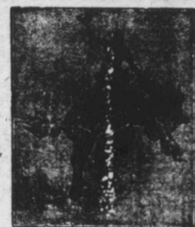
The lady bronc and trick riding has always been a feature at the Ft. Worth Rodeo.

Varied entertainment will be the watchword of the Southwestern Exposition and Fat Stock Show, which will be held at Fort Worth March 5 to 12. With an exhibition of blooded livestock that promises better than