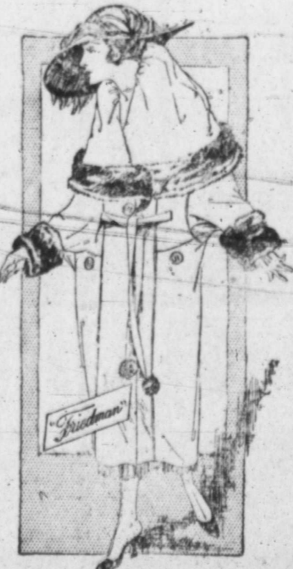
MODEL NO. 6 Showing a Coat of Beautiful Proportions and Trim

Serge and tricotine dresses gorgeously trimmed, satin and Jersey silk for novelties, all constitute a perfect collection of needed dresses for street wear.