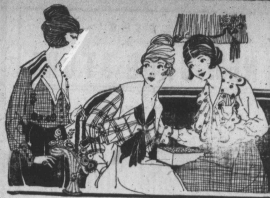
Our showing of Georgette and White Voile Waists will convince you that their style and values are paramount