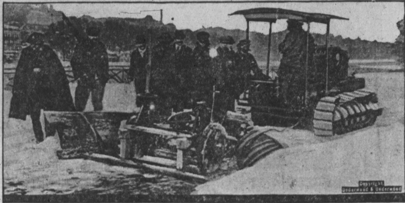
Following a heavy snowstorm in Paris a new snow plow drawn by a Renault tractor was put into commission to clear the walks, with great success.