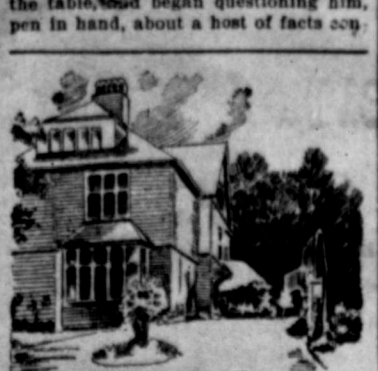
SIR WALTER BESANT'S HOUSE.