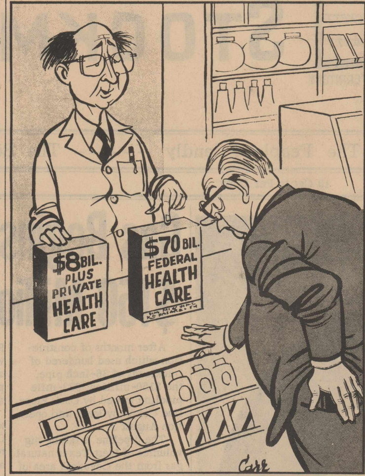
COMBINATION HEALTH PLAN IS BETTER