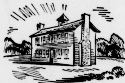
Ruthersville University, Texas' first institution of higher learning, founded in Fayette County in 1840, has become Southwestern University. Baylor University and Mary Hardin-Baylor College were founded at Independence in 1845, the University of Texas in 1881.

Southwestern Life, believing in education, maintains a superior training program that its 400 representatives may render better Life Insurance service to Texas.