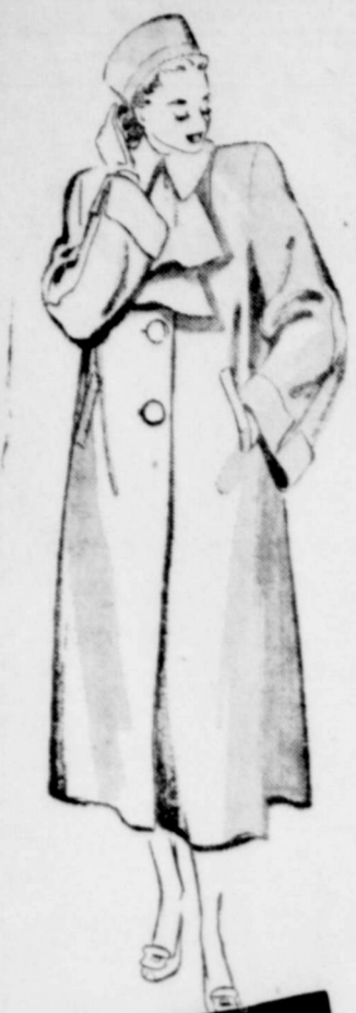
Betty Rose COATS and SUITS

face framing... compliment aiming! Our Betty Rose coat, fashioned for flattery with a deep collar and self-ascot tie, elegant cuffs and flaring hemline. Pure wool Regency worsted gabardine. In grey, blue, brown and wine. Sizes 10 to 16.