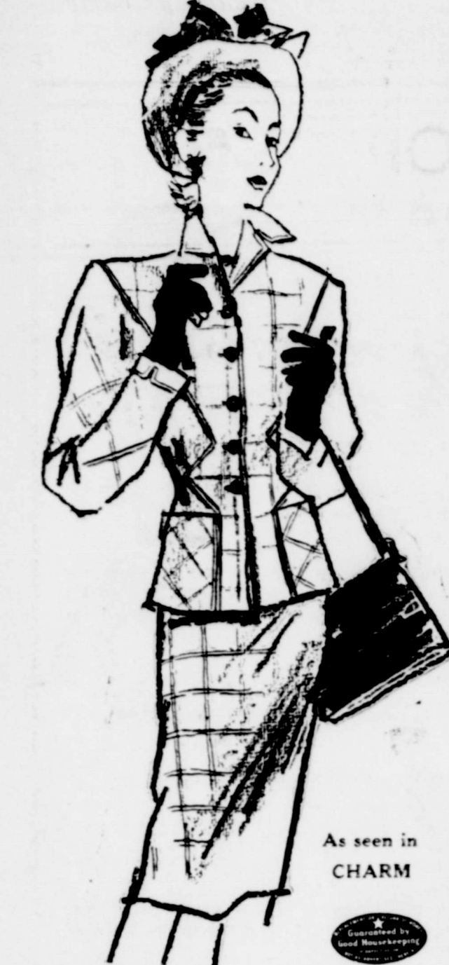
As seen in CHARM