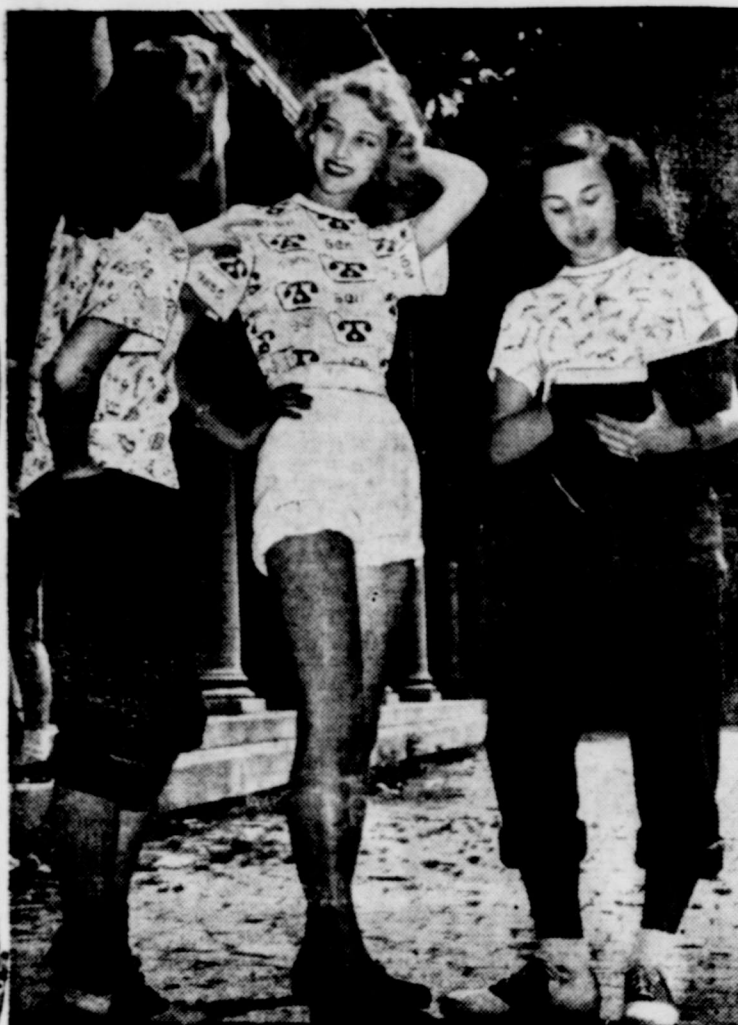
Something new has been added to SHIRTS!