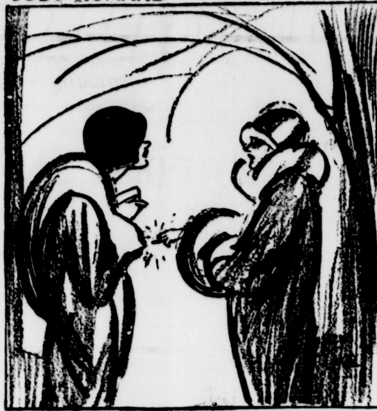
"Mabel, He Must Have a Lot of Jack!" "He Did, My Dear!"

The Federal Government is again offering "all risk" crop insurance to wheat growers this year. The insurance is available now in all states.